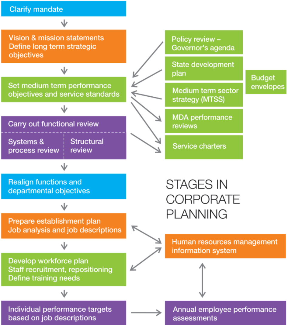
Figure 2: Summary of the Corporate Planning Framework

Corporate planning can be best understood by breaking it down into a number of stages, as shown in Figure 2.